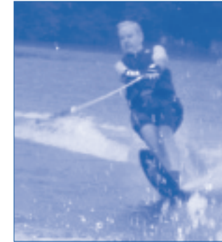
Jim finds the time and energy to participate in a favorite activity, water skiing

In 2002, I noticed that I was tiring easily. After several tests and doctors not finding "anything wrong," the answer came six months later when I visited the ER with bleed-